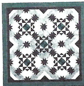
Original (63" x 63") size shown