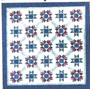
Throw (81" x 81") size shown