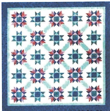
Image is of Throw size.

*Not in pattern; adjustments will be provided in class to those owning the pattern.