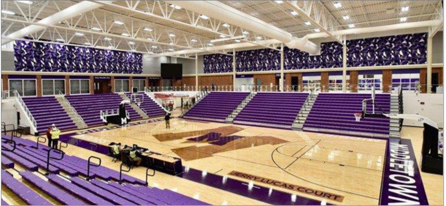
Digitally-imaged fabric finish ESSI Silentspace Acoustical Wall Panels