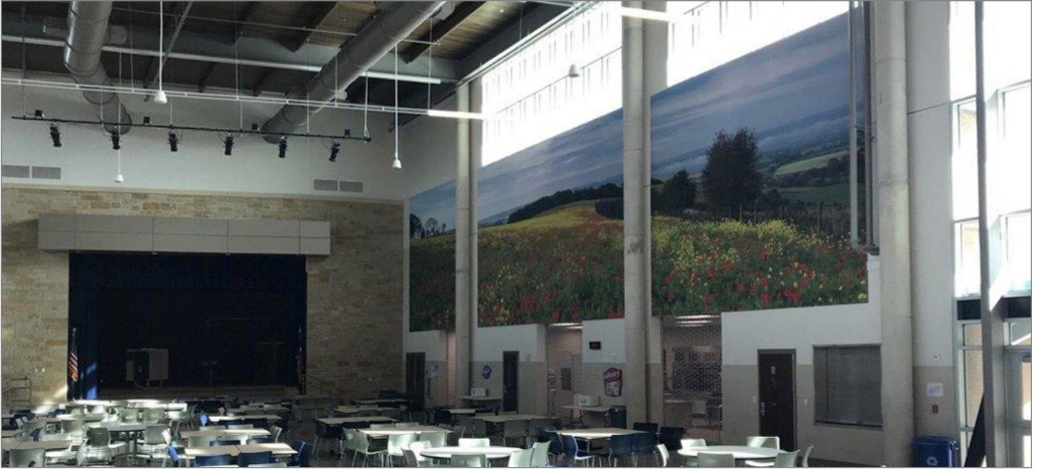
Digitally-imaged fabric finish ESSI Silentspace Acoustical Wall Panels