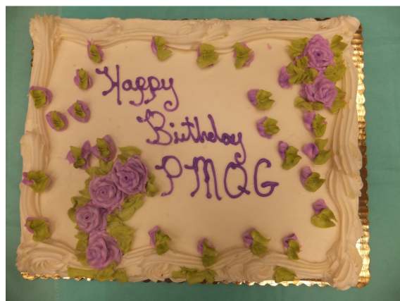
Congratulations 28 years later.

If you have something you want included in the newsletter please forward to kre8fl@yahoo.com Articles such as recipes or quilt shows/events, tricks or tips, news about members are due to the Editor by the first Wednesday of the month.