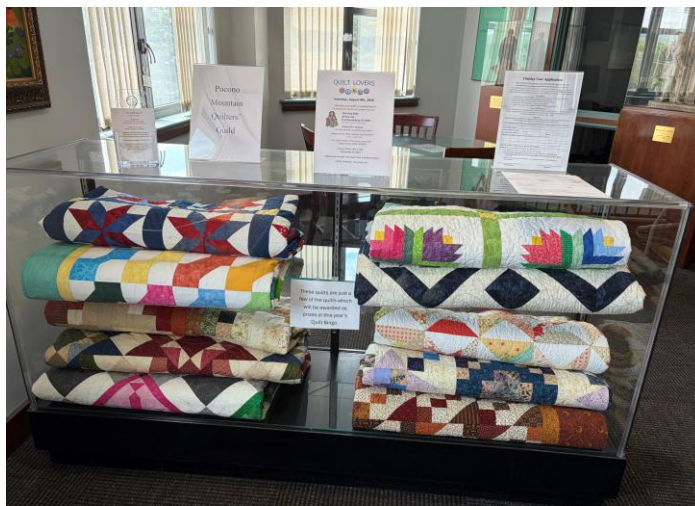
Some of the 2026 Bingo Quilts displayed at the Hughes Library on North Ninth Street in Stroudsburg.