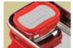
LEAK PROOF INNER CONTAINER