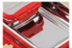
MIRROR FINISH INTERIOR