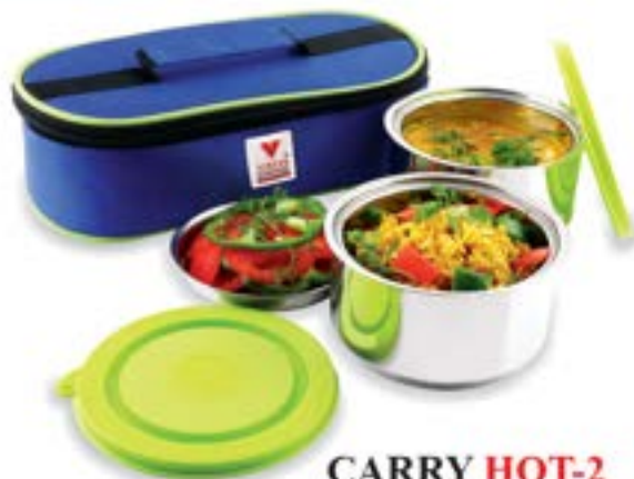
CARRY HOT-2 FLAT