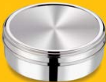
STAINLESS STEEL LID