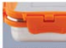
MIRROR FINISH POLISH