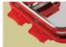
ALL SIDE LOCKING