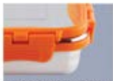
DETACHABLE LOCK CLIPS