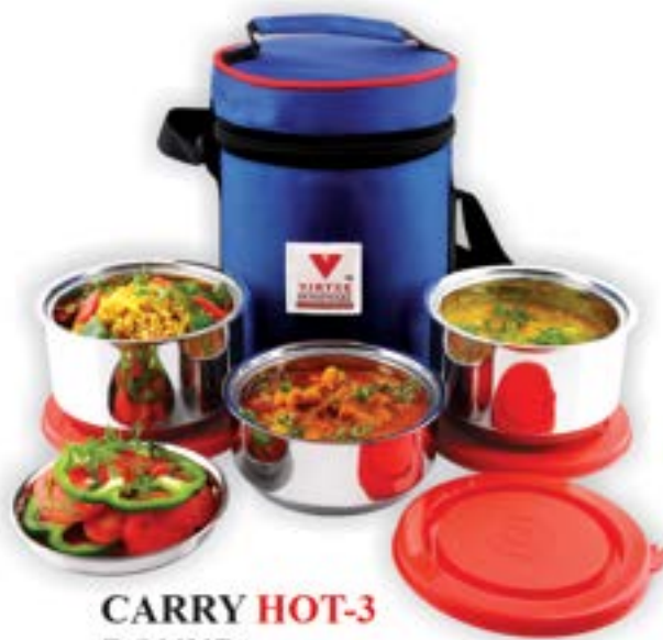
CARRY HOT-3 ROUND