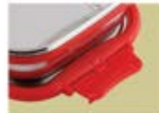
DETACHABLE LOCK CLIPS