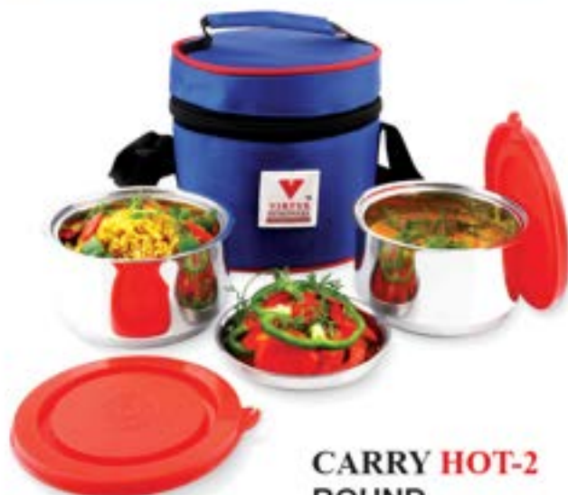
CARRY HOT-2 ROUND