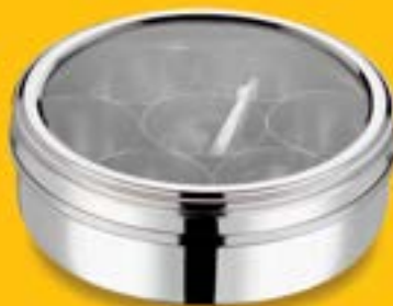
SEE THROUGH LID