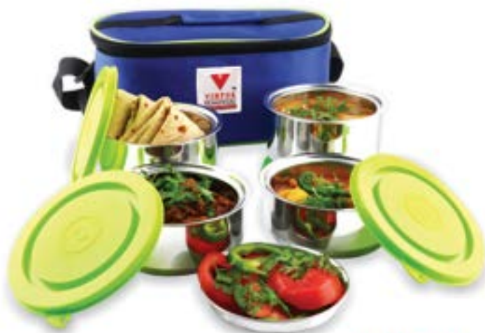
CARRY HOT-4 FLAT