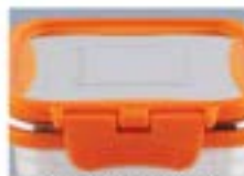
ALL SIDE LOCKING