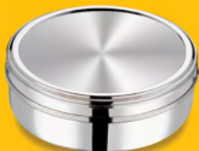
STAINLESS STEEL LID