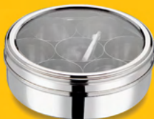
SEE THROUGH LID