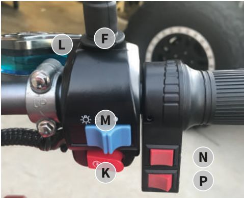
HANDLEBAR - RIGHT SIDE CONTROLS