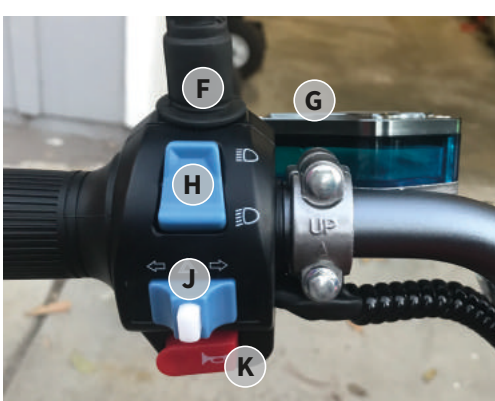
HANDLEBAR - LEFT SIDE CONTROLS