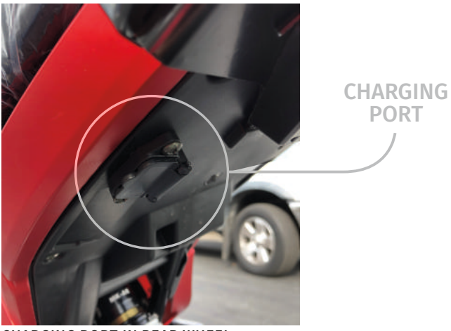
CHARGING PORT IN REAR WHEEL WELL ON LEFT SIDE

2 In the rear wheel well (on left side) you will find charging port.