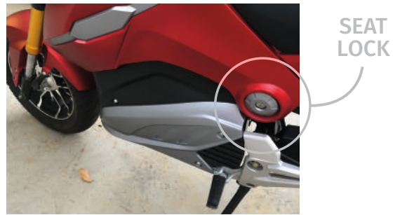
OPEN SEAT TO ACCESS BREAKER

1 When you first receive your new bike, make sure the bike's main circuit breaker is ON (breaker located under the seat). To charge the battery pack, the bike's main circuit breaker must be ON. If the breaker is off, the charger will only seem like it is charging the battery.