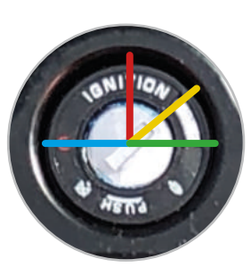
KEY IGNITION POSITIONS