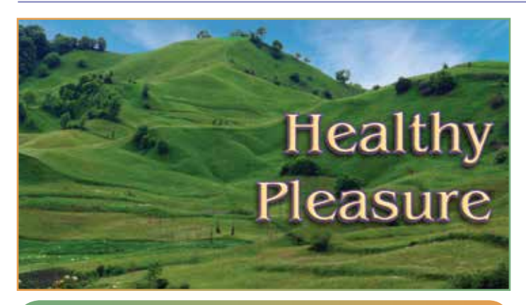
Engaging in Simple, Healthy Pleasures Can Restore Balance to our Hectic Lives

Pleasure guides us to better health. When experiences are enjoyable, we want more of them. Our bodies tell us that sleep, reproduction, eating, companionship, and exercise – to name just a few of our common daily activities – are enjoyable. Our survival depends on engaging in these activities. And we define these basic actions as sources of fun or pleasure, and this may explain why we feel impelled to engage in them.