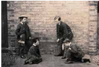
CC ~ Boys playing marbles

Although we do not have control over all the causes of violence in children, we can at least take steps to help our kids grow up with a sense of love and safety, as well as the skills to know how to resist violence in their lives. The rewards of effective parenting are enormous. If your household is characterized by violence, or if your child seems prone to excessive anger or violent behavior, realize that there is effective help through therapy. Our children are our legacy and the future. They deserve love and the wisdom that we can pass on to them.