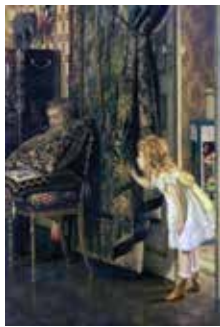
CC - Jan Vermeer - A cache-cache

Behavior problems and delinquency are less likely to develop when children, especially at an early age, have a parent or other adult who is involved in their lives. Every child needs a consistent, strong, and loving relationship with an adult to develop a sense of trust and feel safe. Without this bond, a child may grow up to become difficult to manage, hostile, and distrustful. It is often a challenge to show love to a child on a consistent basis. If you feel unable to do this, it is helpful to seek the guidance of a therapist who can lead you to uncover the reasons for this difficulty, as well as encourage you in a safe and supportive therapy setting to learn new responses that can alleviate difficulties for both you and the child. Children have minds of their own – as they grow and become more independent, they may behave in ways which anger and frustrate you. You need patience and a commitment to see things through their eyes in order to deal with your own feelings. Try not to respond to your child with hostile words and actions – this approach only serves to teach the child that aggressive behavior is the way to deal with emotions.