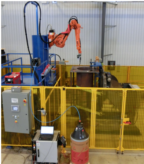
Robotic welding ensures consistent quality, every time.

Ionic designs, builds and commissions custom welding manufacturing solutions for a variety of applications. The innovation and expertise we bring to welding projects creates ease of automation, strong parts, improved cycle times and reduced costs. Ionic can develop a product design, custom fixtures and perform weld trials to ensure quality of product. Quick change fixtures allow for rapid re-tooling.