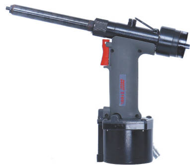
B160/B160L RIVET TOOL