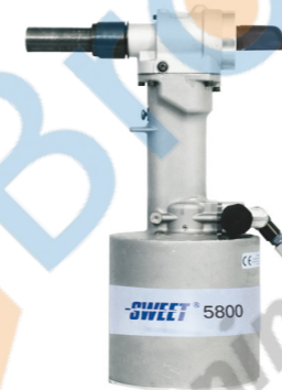
5800 (BOM) LOCKBOLT TOOL