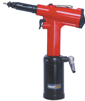
N60 RIVET NUT TOOL (ADJUST FORCE)