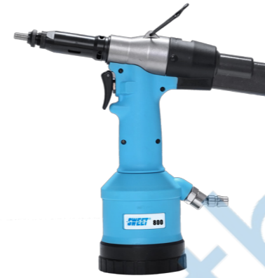
800/800K RIVET NUT TOOL