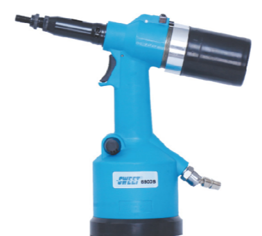
6900s RIVET NUT TOOL