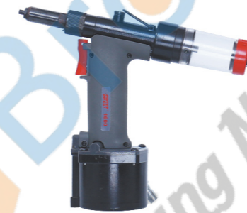
1600 RIVET TOOL