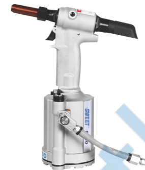
5600 LOCKBOLT TOOL