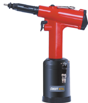
N70L LONG STROKE RIVET NUT TOOL