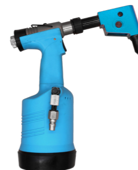
7800-90° BLIND RIVET TOOL