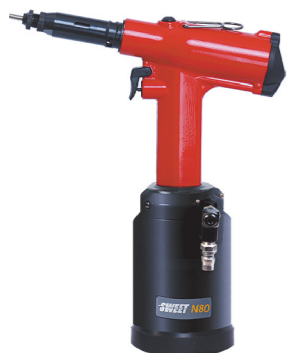
N80 RIVET NUT TOOL