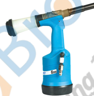
6500 RIVET TOOL(long with barrel assembly)