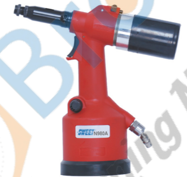
N980A RIVET NUT BOLT TOOL