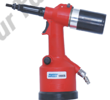
9900s RIVET NUT TOOL