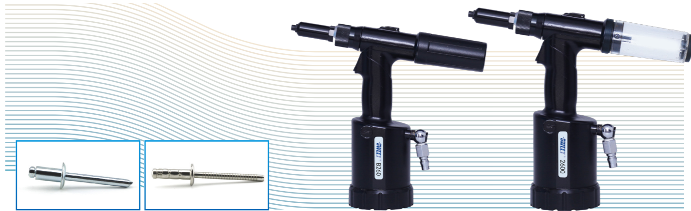
B260/2600 RIVET TOOL