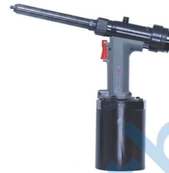
B340/B340L RIVET TOOL