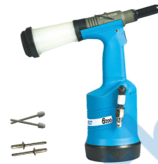
6200 HEMLOCK RIVET TOOL(Avsell)