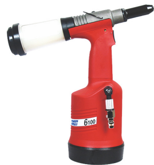
6100 RIVET TOOL