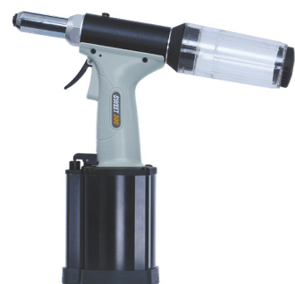
300 RIVET TOOL