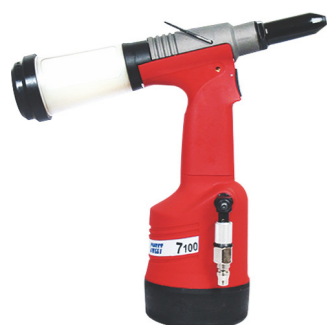
7100 RIVET TOOL