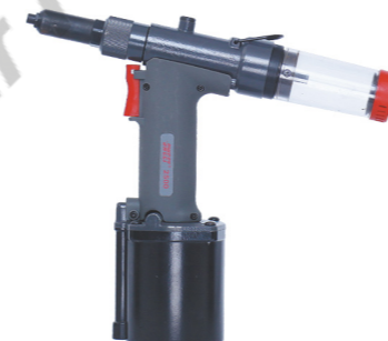
2500 RIVET TOOL