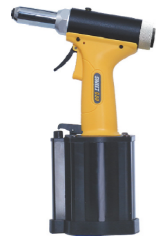
C50/C50L RIVET TOOL

Can provide 160mm-280mm extended gun head option