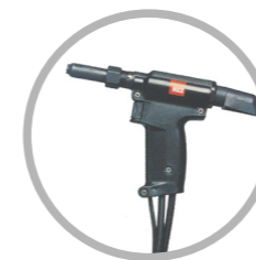
Lockbolt Pneumatic hydraulic station