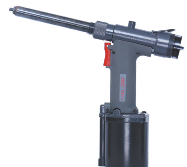
B250/B250L RIVET TOOL