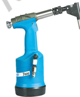
7600-90° BLIND RIVET TOOL