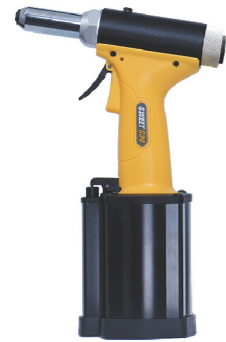
C30 RIVET TOOL