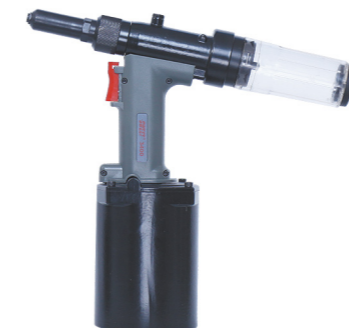
3400 RIVET TOOL