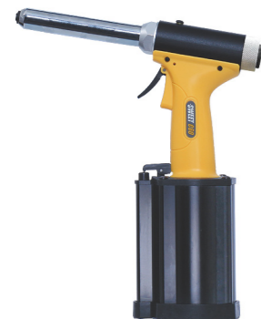
C60/C60L RIVET TOOL

Can provide 160mm-280mm extended gun head option