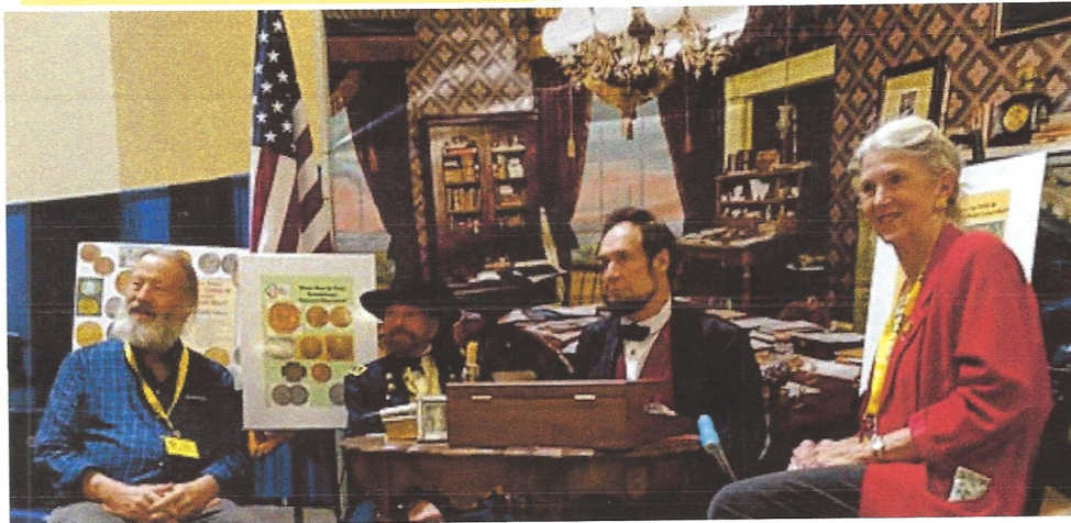
Photo of the four of us chatting about which Coins, Confederate and US currency, sutler tokens, 1860 Election Token, Dog Tags and fractional notes were possibly in each of their "saddlebags" & "pockets"!