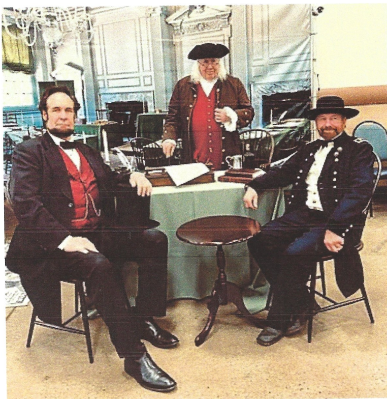
Lincoln, Franklin, and Gen. Sherman