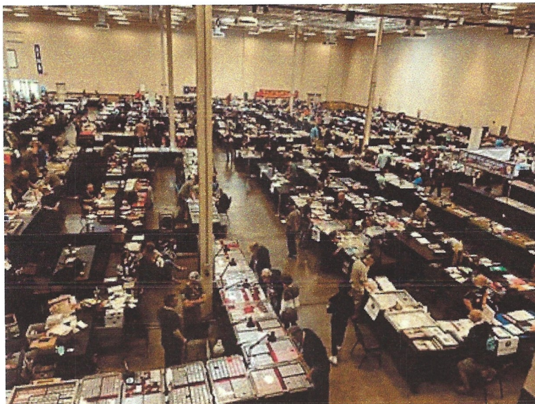
Panoramic shots of the bourse floor