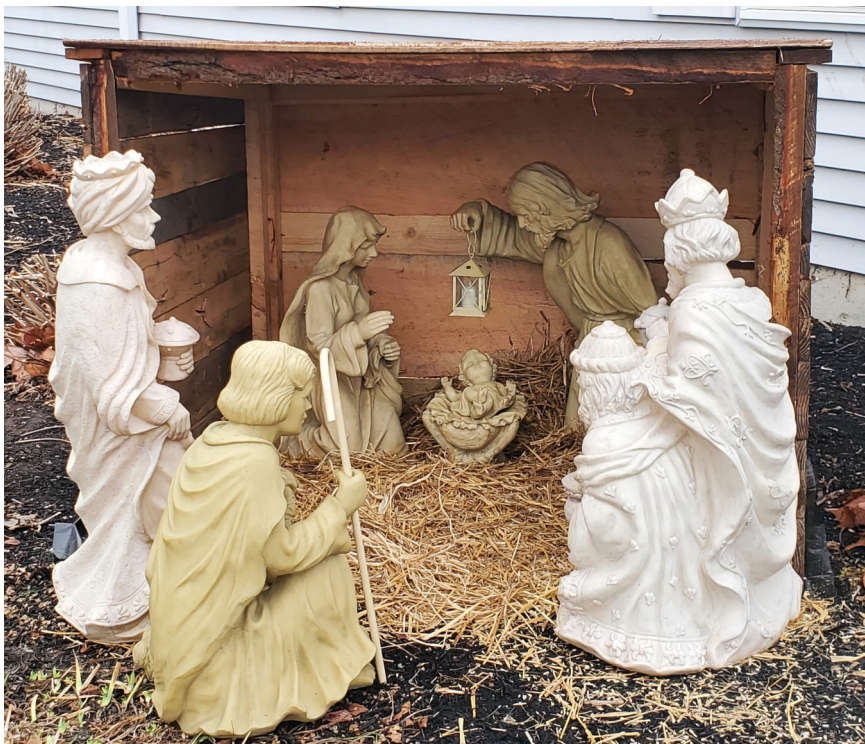
Lower Marsh Creek Church Nativity Scene December 2025