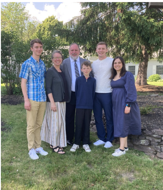
Family And Friends Gathered.