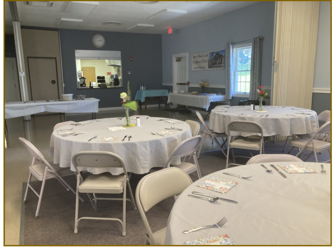
Fellowship Hall was prepared !