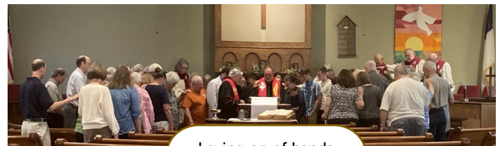
Laying on of hands