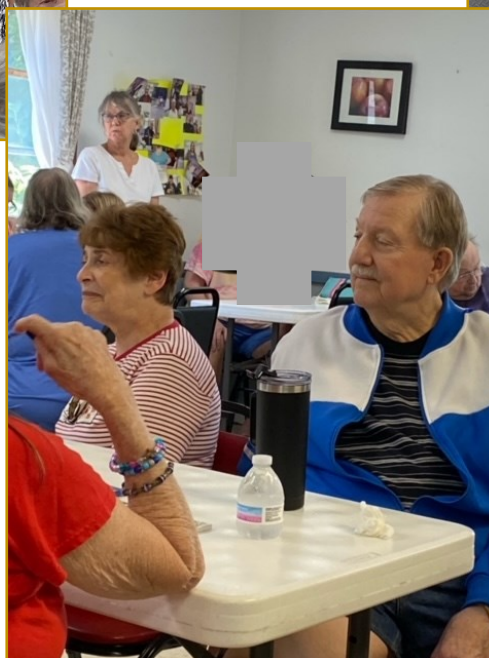
An afternoon of Ice Cream and Bingo with the residents