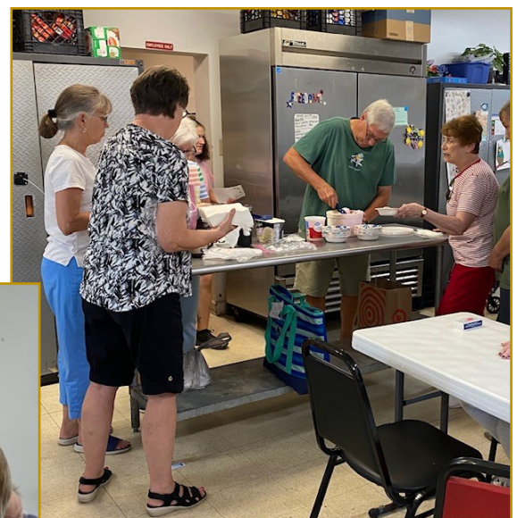
Hillside Nursing Home