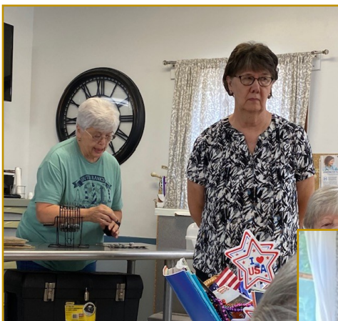
Women's Guild July 15, 2024