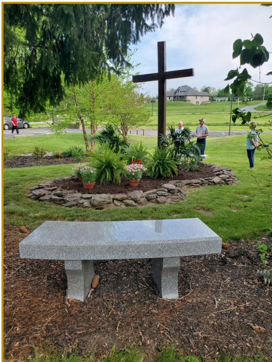
National Day Of Prayer Service May 1, 2025