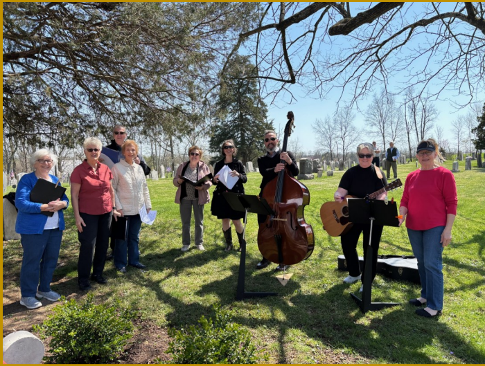
Good Friday Service at the LMCC Cemetery