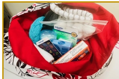
Contents of the bags