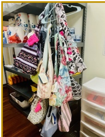
15 filled bags awaiting distribution to the women of Agape House.