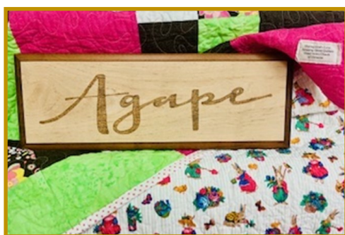
The Agape sign is on top of one of the quilts that the Amazing Grace Quilters recently donated. The label reads, Sharing God's Love .

Editor's Note: Please see page 8 for the response from the recipients of these bags.