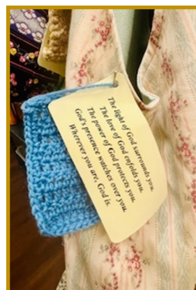
Prayer cloths and prayer cards that were attached to the bags >