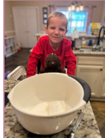
We now have a new helper in the kitchen!