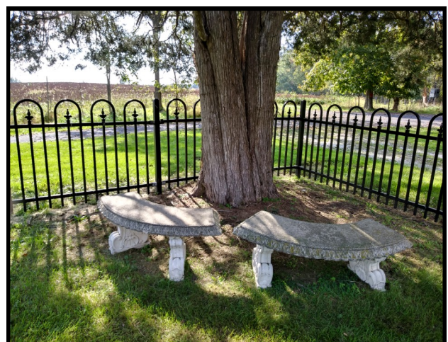
Another meditation spot in the cemetery