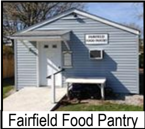
Fairfield Food Pantry

Last month I began to highlight some of the mission organizations and missionaries (a total of 24) that LMC's 2021 Mission Organization/Missionary (MOM) Budget helps to support, locally and around the world. This month we continue to explore these groups and what they do.