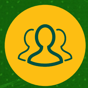
55 DISTRICT TEAMS