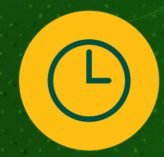
43 YEARS ESTABLISHED