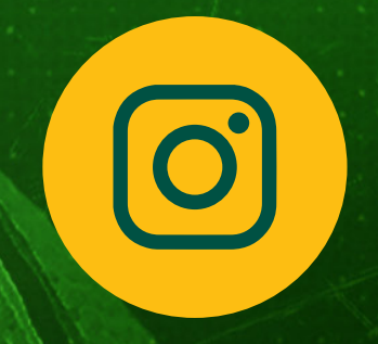
1500+ INSTAGRAM FOLLOWERS