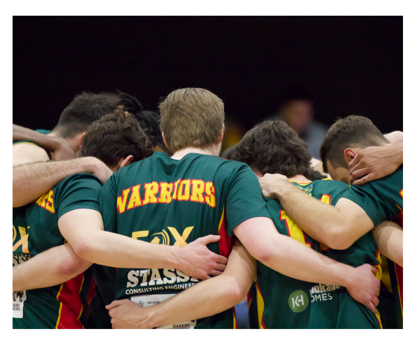
2022 NBL1 Central Mens Grand Final