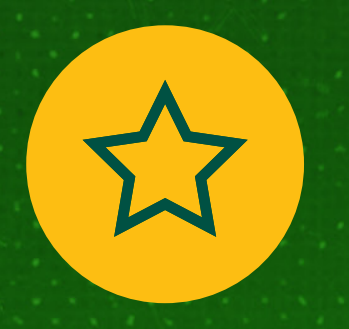
3 NBL1 / PREMIER LEAGUE CHAMPIONSHIPS