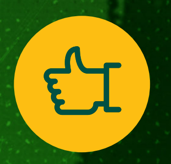
25,000+ ANNUAL SPECTATORS