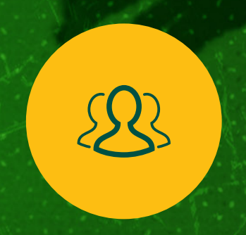
45 DISTRICT JUNIOR TEAMS