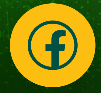
2700+ FACEBOOK FOLLOWERS