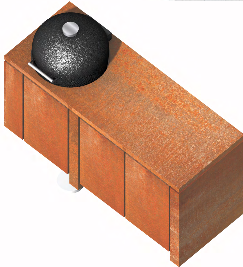
02 Top View and Axo view

Notes; All site dimensions from Architect drawings or agreed survey. Layout of plan as agreed All finishes for the concrete surfaces, and pavements and stair tread to be agreed with client.