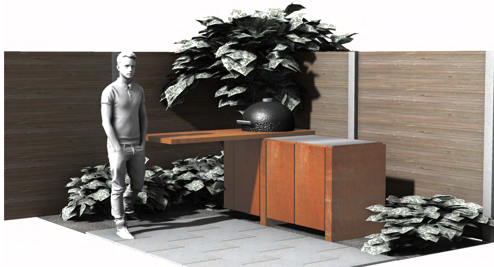
01 Visualisation open and closed