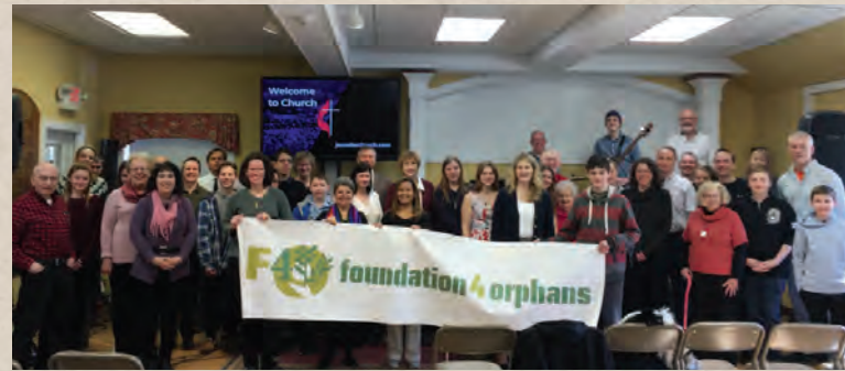
Pictured here are photos of the Jesse Lee Home For Children, and church members at their traditional and contemporary worship services.