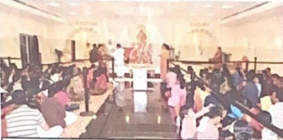
Shirdi Sai Baba Temple Atlanta, U.S.A.

On March 30th, the Holi/Dulheti was celebrated in the temple. Hundreds of devotees enjoyed Holi. This event would not