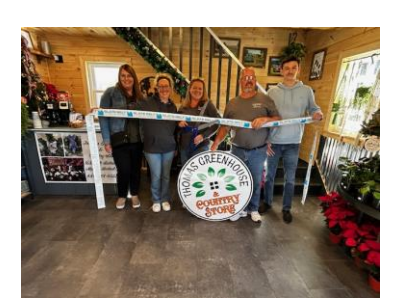
Thomas Greenhouse Grand Reopening