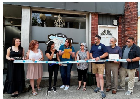
Pilates & Wellness in downtown Bangor