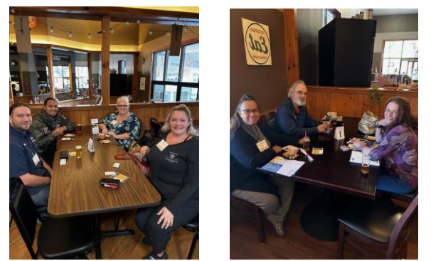
Speed Networking Event hosted by Allegheny Creek Brewing Co.

Chamber events in October were well-attended and enjoyed by the membership! The Speed Networking Event was a great success – watch for another to be scheduled early next year! The Fall Business Luncheon was a beautiful day and allowed members to make important connections!