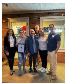
Acre and Estate Grand Opening