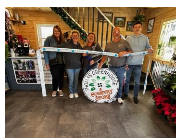
Thomas Greenhouse Grand Reopening