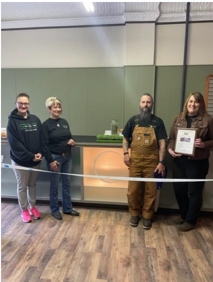
NuHydro Farms Grand Opening