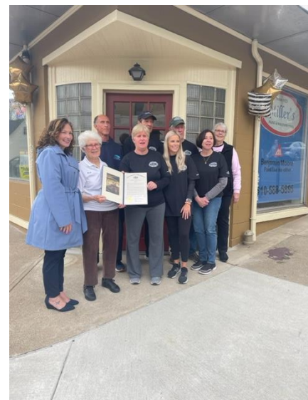
Miller's Paint & Wallpaper 100 Years