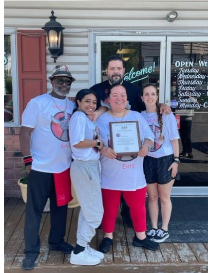
Good Azz Eats One-Year Anniversary