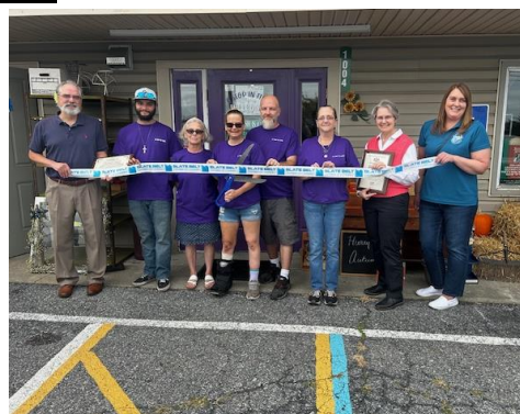
A Stop in Time Grand Opening!