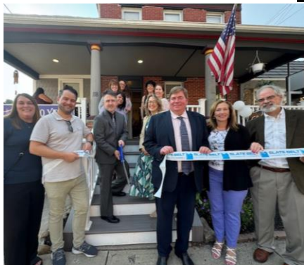
A Clean Slate 10-Year Anniversary Celebration!