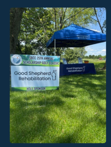
Hole Sponsor: Good Shepherd Rehab