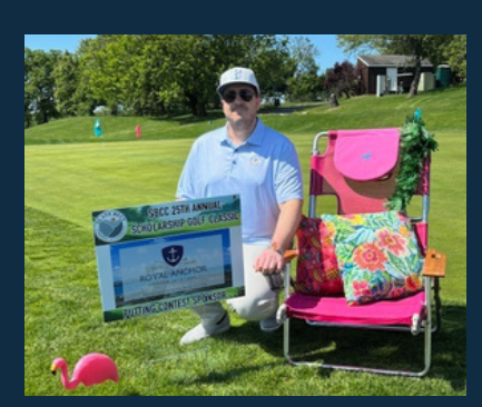
Putting Contest Sponsor Royal Anchor Cruise Vacations