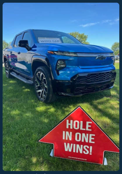
Hole in One Sponsor: Wind Gap Chevy