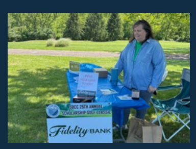
Hole Sponsor: Fidelity Bank