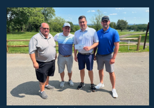
First Place Team