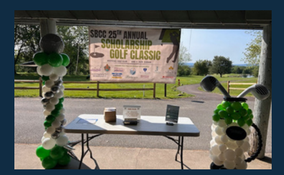
Display by: Balloon It Up Signs/Banners by: Tint Wurx Signs & Graphics