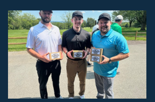
"Most Honest' Team