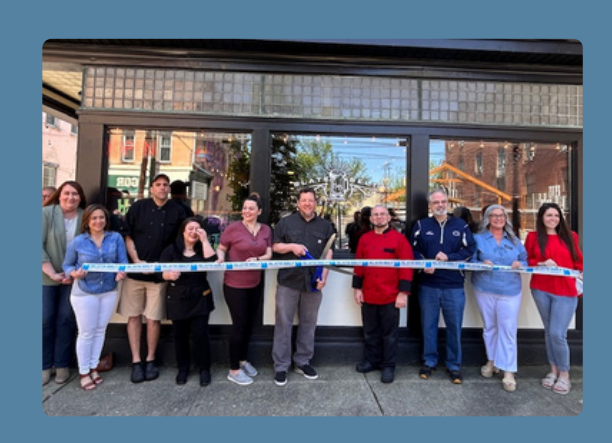
Slate Belt Brewing Company