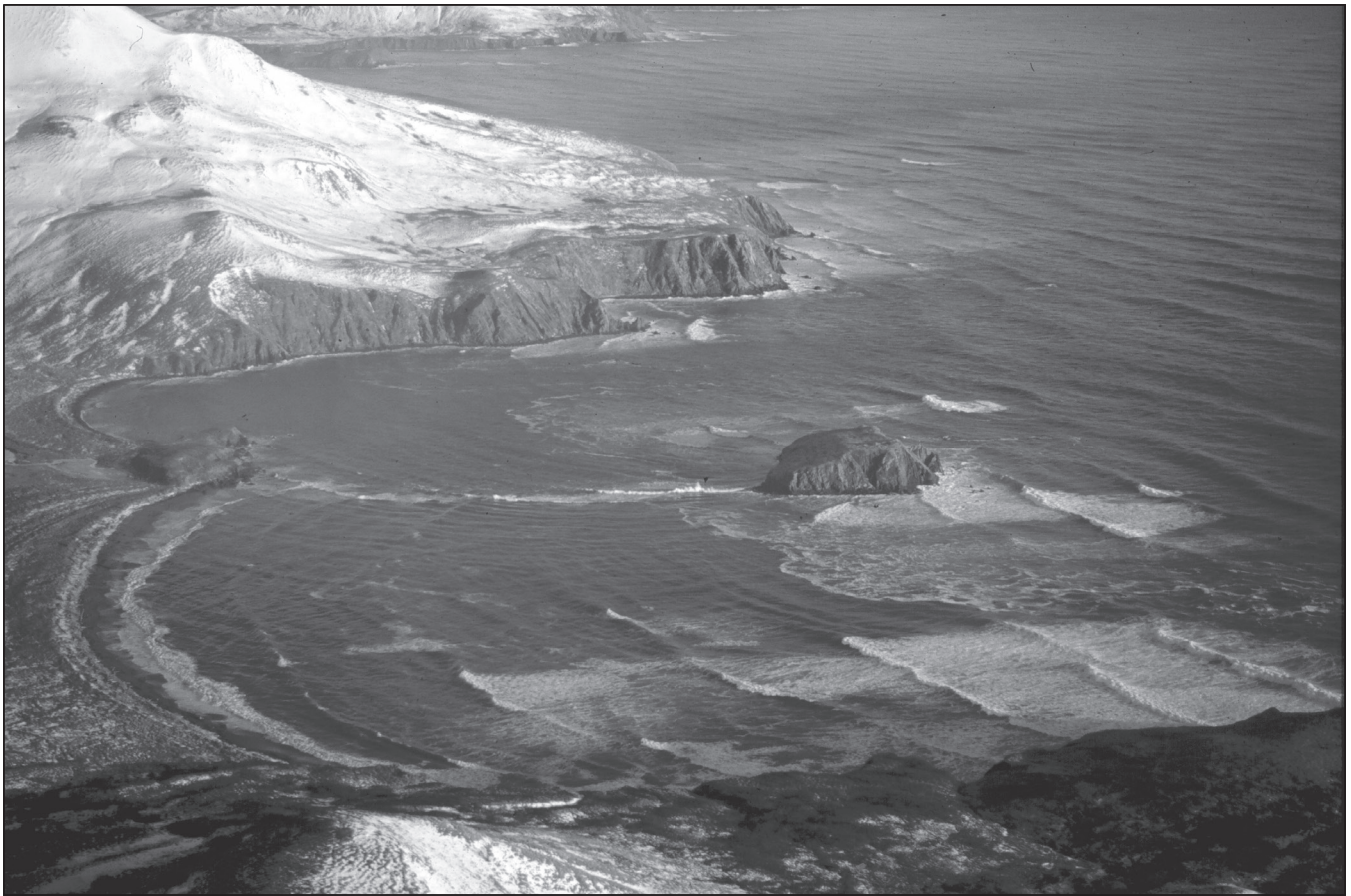
Figure 1. Aerial view of Awa'uq (Refuge Rock) looking north, December 2000.

et al. 2002). Further analysis of the faunal remains was not conducted prior to the current study. If any natural or arbitrary stratigraphic breaks were used in the field excavations, no record of that was documented. Thus, the entire assemblage is treated here as one cohesive unit, spanning an unknown period of accumulation prior to the abandonment of the village in 1784. Note that if some or all of this particular midden deposit is associated with the Koniag-age house pits, the materials could date to as early as AD 1200.