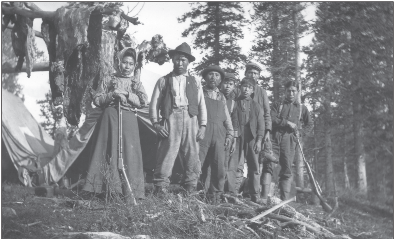
Figure 4. Native family with hides and guns after a hunt, near Seward, ca. 1896–1913. Elsie Blue Collection, SCL-15-84. Courtesy of Seward Community Library.

A rare turn-of-the-century photo (Figure 4) showing an unidentified Native hunting party in the forest near Seward appears to portray a northern Kenai Peninsula Dena'ina family, perhaps on a visit from the Squilantnu