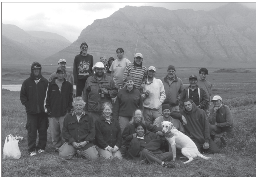
Figure 7. The 2004 field crew at the Tuktu-Naiyuk site included students from the villages of Noatak and Anaktuvuk Pass.

The success of educational programs can be measured in many different ways. In theory, we might measure success by estimating the total number of people who benefit