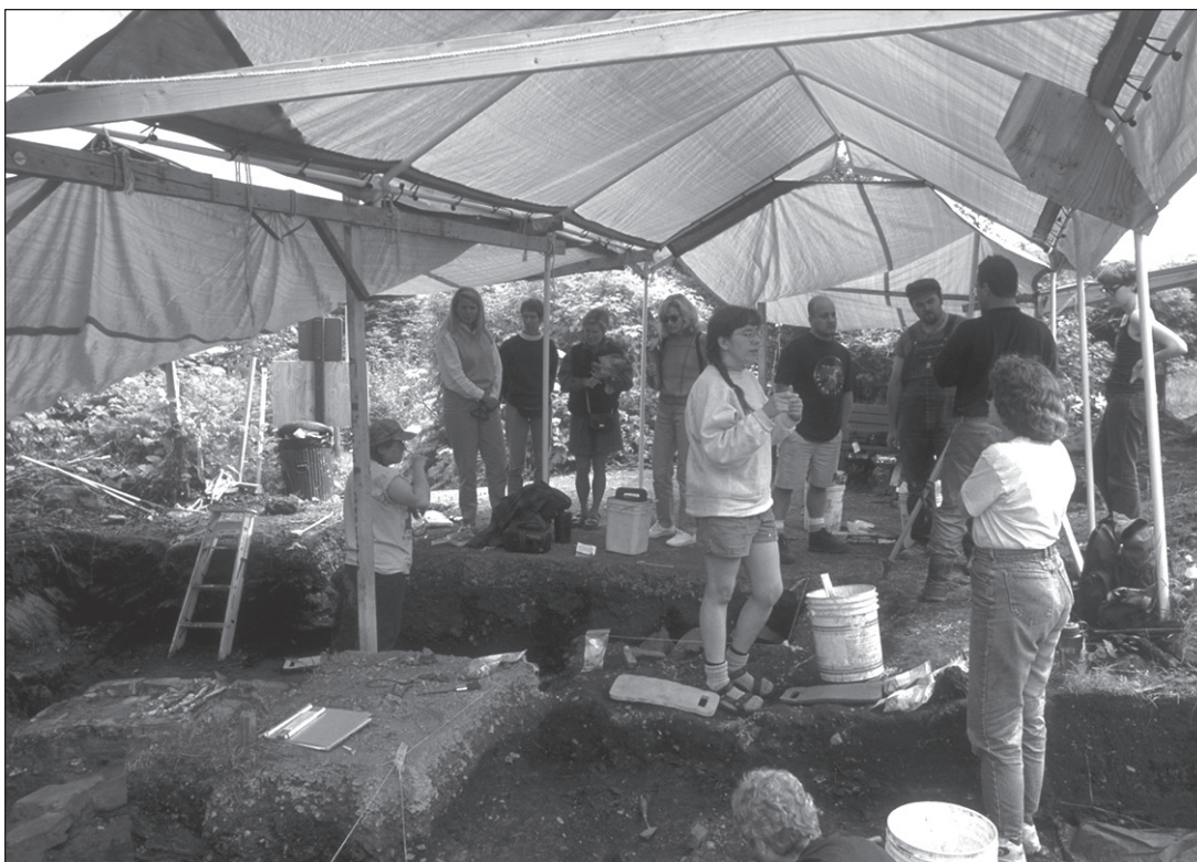
Figure 1. Visitors learn about Alaska history and archaeology while visiting the Castle Hill site excavations in Sitka.

Although educational programs are legislated as one of the many activities integral to cultural resource management (CRM), there are few guidelines that specify exactly what form these programs should take. Depending on an agency's emphasis, the specific job description, and the CRM staff's individual interests and inclinations, education can be interpreted to mean anything from simply making the results of a CRM report available to the public to establishing a nationwide program for school-age children and their teachers. This very broad definition of what public education actually encompasses provides an opportunity for some innovative approaches. This paper will highlight the variety of approaches used by state and federal agencies nationally and in Alaska. Some fundamental questions in planning and implementing these programs are also addressed. Who are the appropriate audiences for public education programs? How do we measure the success of these programs, and are they effective in bringing about changes in public perception of the value of our cultural resources?