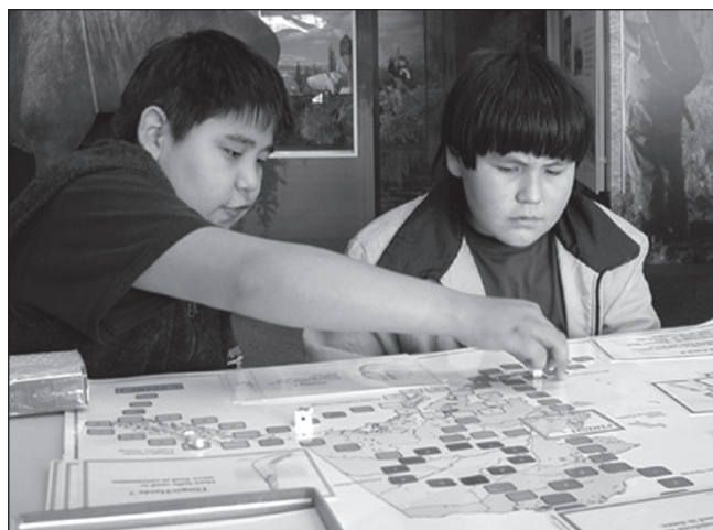
Figure 2. Two boys play the "Alaska Board Game" at an Archaeology Month event at the Alaska Native Heritage Center in Anchorage.