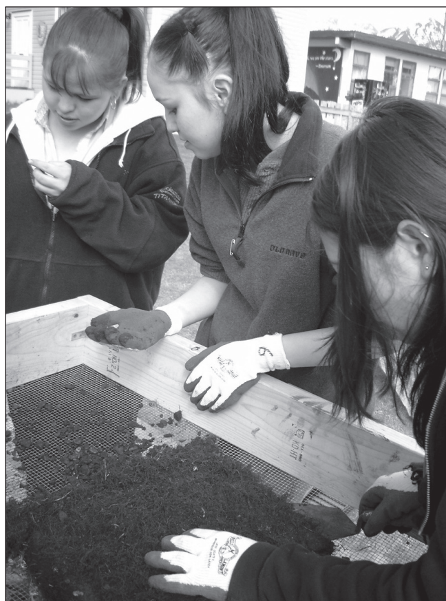
Figure 5. Pacific High School students studying Alaska history examine artifacts during an archaeological excavation at the Russian Bishop's House National Historic Landmark in Sitka.

The audiences for public education programs are different in the urban Anchorage area than in the small communities of southeast Alaska. Much of the public outreach in Anchorage and the Matanuska-Susitna Borough involves classroom visits to elementary, middle, and high school classrooms. One innovative year-long program, sponsored by the Office of History and Archaeology and the U.S. Fish and Wildlife Service, provided fifth and sixth grade students at Chinook Elementary in Anchorage with the opportunity to learn the fundamentals about archaeology and to participate in a real archaeological testing project on the Russian River. At school, the kids learned how to analyze artifacts and write reports; while in the field, they learned how to use a compass (Fig. 6) and to dig small test pits, coached by a cadre of state and federal archaeologists. OHA is also the Alaska sponsor of Project Archaeology and is involved in organizing teacher workshops throughout the state. The BLM in Anchorage takes advantage of its large tract of wooded acreage at the Campbell Creek facility by hosting an annual Outdoor Week, which in-