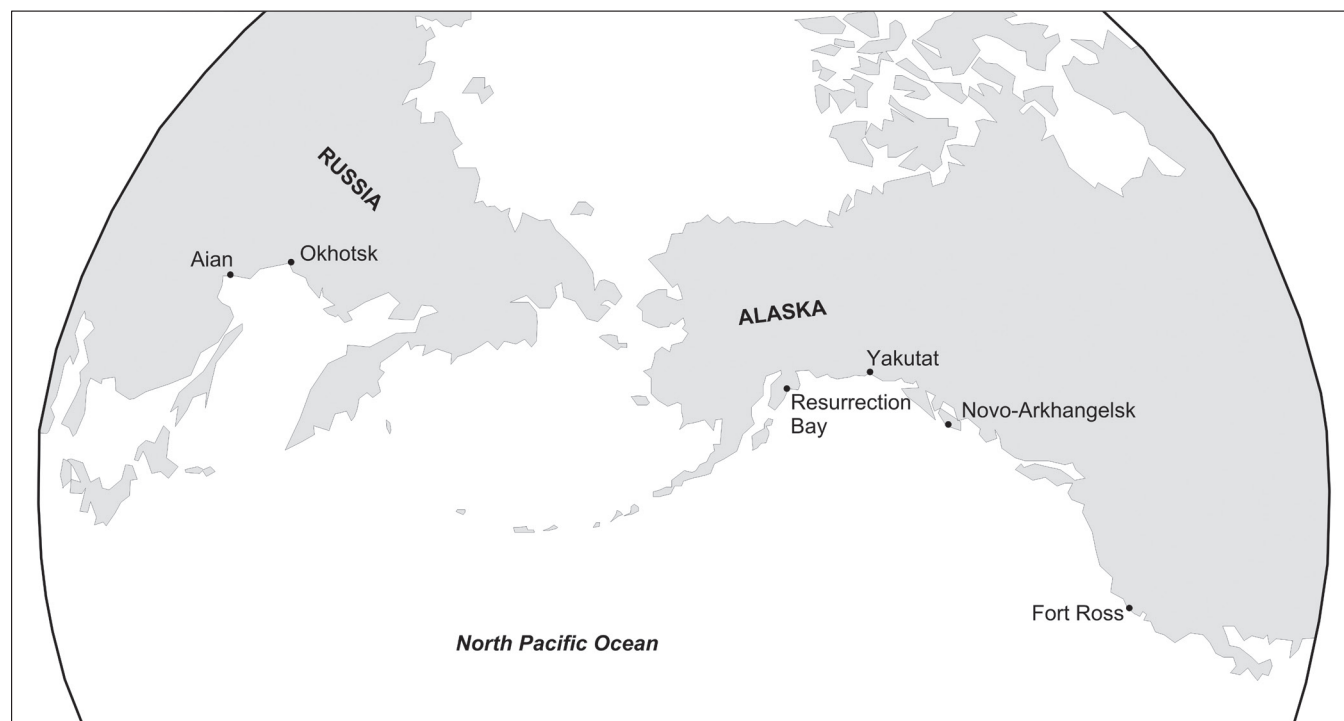
Figure 1. Shipyards of the Russian-American Company. Map by Jason Rogers.

Nevertheless, by 1794 the first Russian shipyard in Alaska and the first shipbuilding facility on the entire Pacific coast of North America began its operation at Voskresenskoe settlement in Resurrection Bay (Seward) (Fig. 1). Here English shipwright James George Shields constructed three ships: the Phoenix , Dolfin , and Sv. Olga . To make up for the shortage of pitch, paint, and oakum, the ships were caulked with a mix of pitch, ochre, and whale blubber. These and other creative shortcuts affected the vessels’ performance. In 1795, only a few months after the Olga was finished, Baranov took her on a voyage to Yakutat Bay. On the second day at sea she sprang a leak and