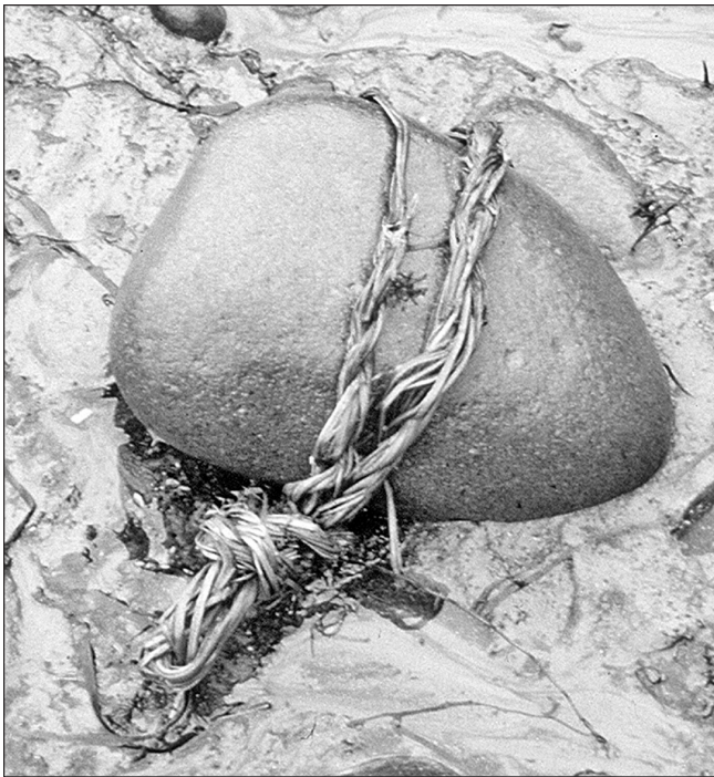
Figure 6. Anchor. Unmodified stone bound with cedar with the cordage, in situ, Little Qualicum River site. About 1000 years old, 30x22x15 cm, 14.2 kg. DiSc-1:216, Archaeology Collections, Royal British Columbia Museum.

craft from the perspective of what their remains might look like in archaeological sites. All these types except rafts are containers (boats) designed to traverse bodies of water while keeping passengers and cargo dry. Technically, rafts are floats (Durham 1974; McGrail 2001).