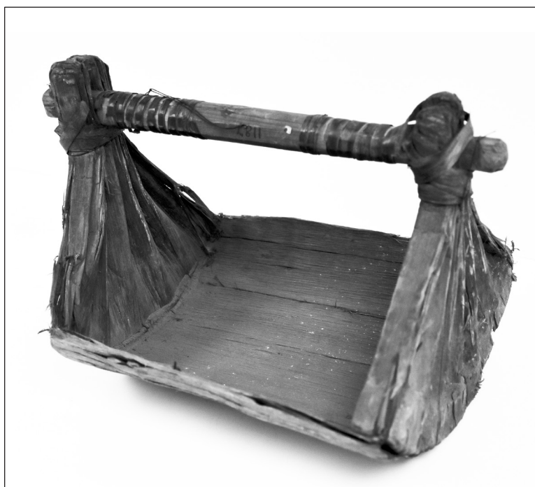
Figure 3. Folded-bark style canoe bailer, 30x20x19 cm. Ethnology catalog no. 1187, Royal British Columbia Museum.

Photographs in the online catalog of the Canadian Museum of History, which is the repository for the Lachane collection, show complete proximal ends of two handle fragments with shaft portions (artifact numbers GbTo-33:C456 and GbTo-33:C523) and a third handle with a shaft that is broken longitudinally (GbTo-33:C627). The scales in the photographs indicate that each of the three is 30–35 cm long and that the handle fragment without a shaft (GbTo-33:C237) measures about 5 cm in its largest dimension. The repository's digital database does not have images or descriptions of the blade pieces (GbTo-33:C134 and GbTo-33:C624). Judging by the photographs, the Lachane paddle handles resemble the Ozette single-piece carved paddles (as described by Friedman 2005 and illustrated in Daugherty 1988:fig.4).