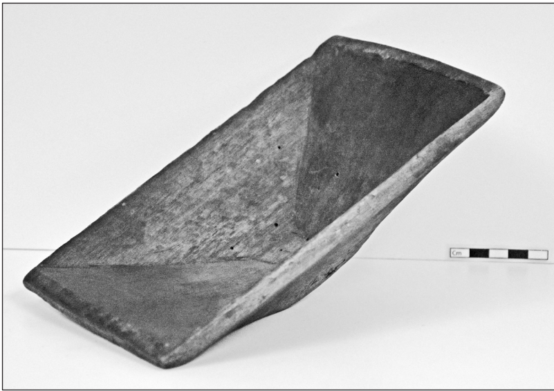
Figure 1. Pyramid-style canoe bailer, 21x13x6 cm. Ethnology catalog no. 7153, Royal British Columbia Museum.

The bailer from the Little Qualicum River site (DiSc-1), on the east coast of Vancouver Island, was recovered from ca. 1000-year-old water-saturated anaerobic deposits in the intertidal zone. It is an incomplete cedar-bark bailer made by creasing a rectangular sheet of western red cedar ( Thuja plicata ) bark and bending each end at a right angle to form a scoop with two open sides (Figs. 2 and 3). The central portion of the bark sheet, that is, the bottom of the bailer, is 250 mm long and 5 mm thick; it appears to be broken lengthwise and probably was nearly square. The side edge was stiffened by inserting two wood splints into the middle of the bark sheet (indicated by arrows in Fig. 2); one of the splints was identified as ocean spray, also known as ironwood ( Holodiscus discolor ). The ends of the bark sheet are 110 mm and 140 mm long, respectively, and were slit at their outer edges and bunched up, perpendicular to the central portion of the bailer. The handle, which is missing, would have been a stick of wood and was probably attached with cherry bark (Bernick 1983:336–338). The folded-bark bailer, which was the usual Coast Salish bailer type, functioned as a scoop rather than a dipper (Barnett 1955:116).