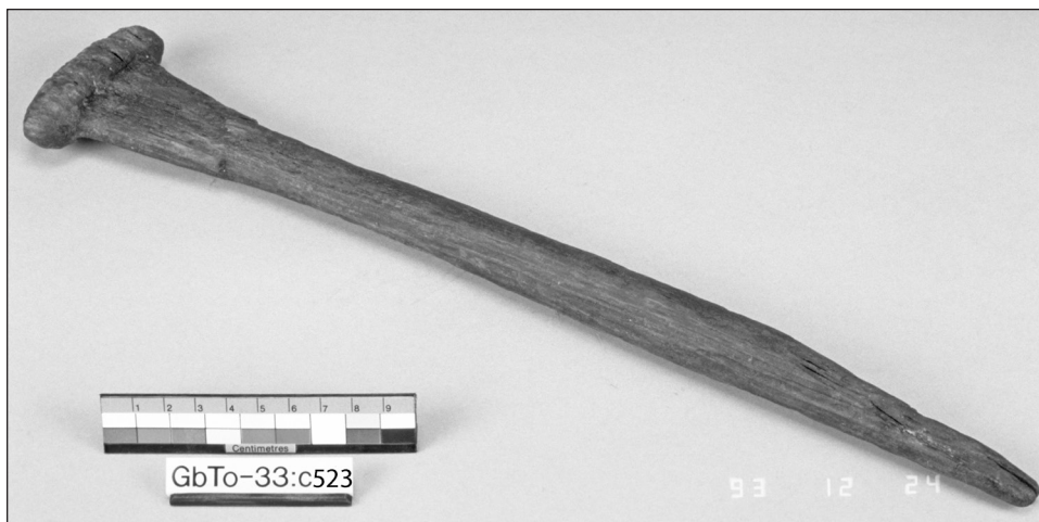
Figure 4. Paddle handle with portion of shaft from the Lachane site in Prince Rupert Harbour, about 2000 years old. Length of fragment, 30 cm. Image credit: Canoe paddle, Canadian Museum of History, GbTo-33:C-523, S94-36600.