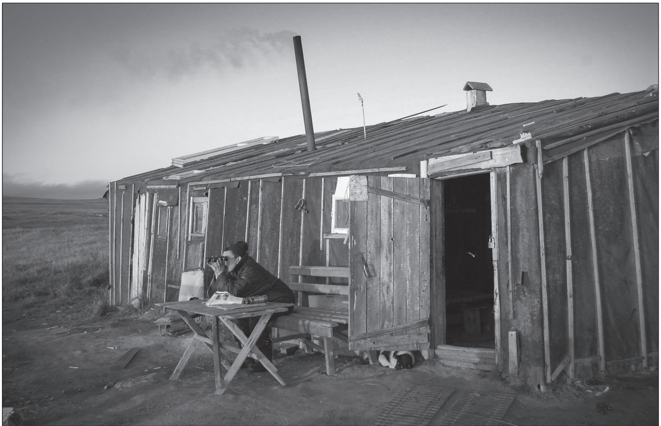
Figure 7. A hunting camp in current use at Akkani, originally abandoned in 1960.

butchering expertise are actively passed on to a younger generation. Many hunters see these reoccupied camps and villages as places of healing.