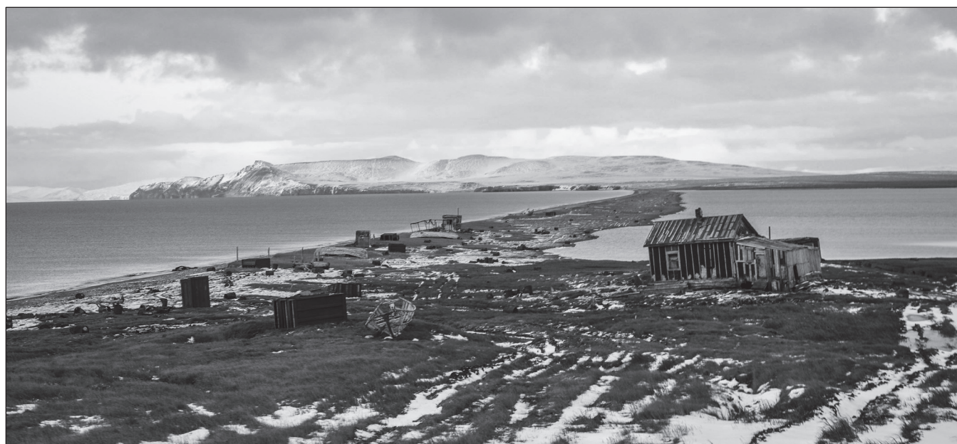
Figure 5. The settlement of Dezhnevo, on the northeastern coast, abandoned in 1951.