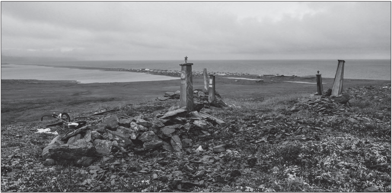
Figure 2. Graveyard at Inchoun.

proach taken here, with all its possible shortcomings, is simple. While I did research in Chukotka on the topic of village relocation and contemporary hunting culture, it was never my intention to explicitly investigate violent death. Therefore, I lack the ethnographic and qualitative data to thoroughly investigate the cultural and psychological dimensions of suicide. Much more research is needed on that topic, but I nevertheless find it imperative and too important to ignore.