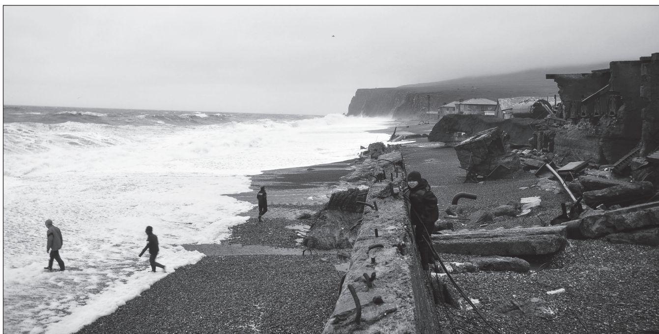
Figure 1. A fall storm on the coast at Uelen. People from several coastal communities were relocated here in the 1950s.