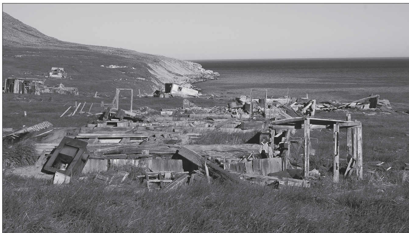
Figure 6. The settlement of Nuniamo, abandoned in the 1970s. Inhabitants were relocated to Lorino, Lavrentiya, and Uelen.

Slava, a former inhabitant of Nuniamo (Fig. 6) who was resettled to Lavrentiya in the 1970s, where a special apartment house had been constructed for those being relocated, remembered the time: