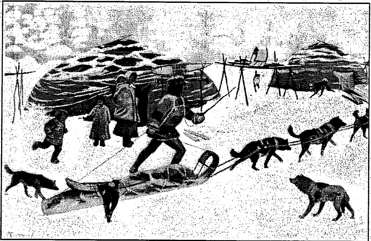
Klondike Indian Village (Tappan Adney 1902)

April 10 – 12, 1997 Westmark Whitehorse Hotel Whitehorse, Yukon