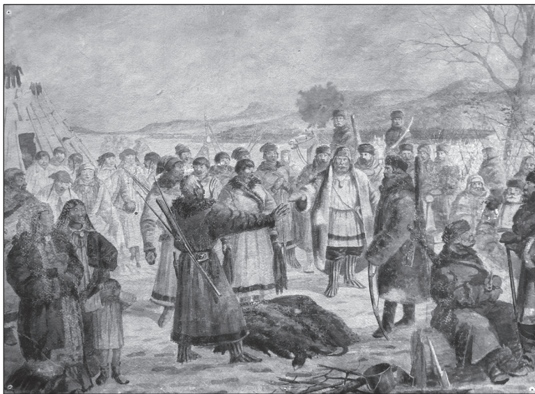
This nineteenth century watercolor by an unknown artist shows Cossacks from the Yenisei River collecting yasak in the form of animal pelts, presumably from indigenous Siberians (perhaps Sel'kups).

These nomads, who were here today but there tomorrow, were not that easy to find. It is quite common to read that the yasak people could not be found in the same feeding place the following year: "we are nomads, not settlers, we go and live wherever we want" is what they said about themselves. They returned to pay yasak irregularly and whenever they wished, as the Berezov yasak book says about the Kazym and Obdorsk Samoyeds. "And it is impossible to find them, the Berezov people, in the