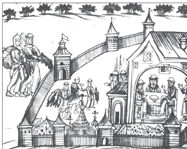
Dating between 1697 and 1703, this picture from the Siberian chronicler S. U. Remezov depicts the delivery of yasak to the Russian ostrog in Tiumen.