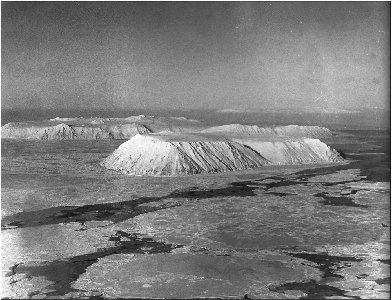
View of the Bering Strait islands of Little Diomedede (foreground) and Big Diomedede