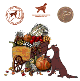
Irish Harvest Specialties

Three Specialty Shows, Sweepstakes, AKC Owner-Handler Series Jr Showmanship-ISCCC and EISA only Two Obedience & Rally Trials (Irish Setters Only), One Great Location TOLLAND COUNTY AGRICULTURAL CENTER 24 HYDE AVENUE, VERNON, CT 06066 (OUTDOORS-UNBENCHED) SHOW HOURS 7AM-7PM