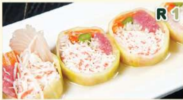
ROCK & ROLL ROLL 14.00

tuna, salmon, white fish, crab, radish, radish sprout with cucumber wrap, ponzu sauce