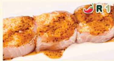
WHITE ROSE 14.00

spicy tuna, crab, wrapped with fresh tuna, spicy ponzu