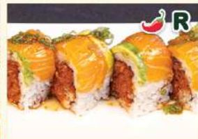
SUNRISE ROLL 13.00

spicy tuna roll with seared tuna and avocado, crispy onion, hot sauce