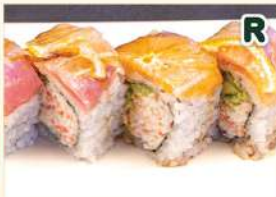
LEMON ROLL 14.00

california roll with spicy tuna, white fish, jalapeno, spicy ponzu, hot sauce