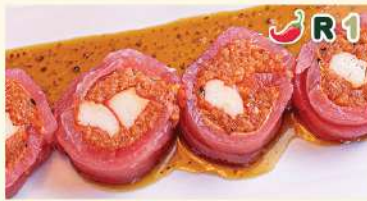
ROSE ROLL 14.00

tuna, salmon, white fish, crab, radish, radish sprout with cucumber wrap, ponzu sauce