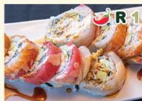
NAMBA ROLL 18.00

5 pcs fried green chili, crab, avocado, cucumber, eel sauce, spicy mayo