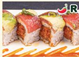
SPICY TATAKUSHI ROLL 14.00

cucumber, avocado, cream cheese and salmon