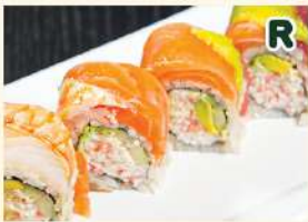
RAINBOW ROLL 13.00