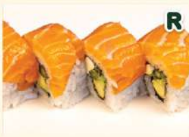
PHILADELPHIA ROLL 12.00

cucumber, avocado, cream cheese and salmon