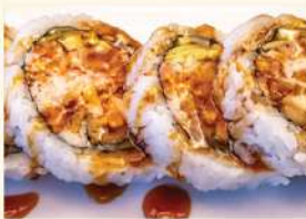
SHRIMP TEMPURA ROLL 9.00