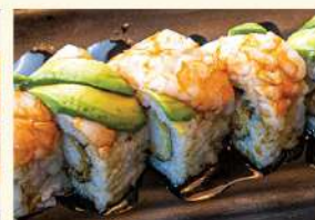
SHRIMP KILLER ROLL 12.00

10 pcs soft shell crab roll, tuna, salmon, white fish, eel sauce, spicy mayo