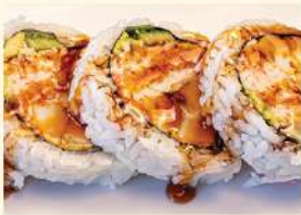
CALAMARI TEMPURA ROLL 8.00