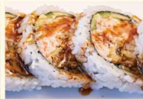
SOFT SHELL CRAB ROLL 12.00

5 pcs cucumber, avocado, crab, yamagobo, kaware, eel sauce