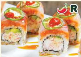
KISS OF FIRE ROLL 14.00

spicy tuna roll with salmon, avocado, green onion, spicy ponzu