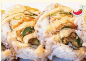
GREEN CHILI TEMPURA ROLL 9.00

5 pcs cucumber, avocado, vegetable tempura, eel sauce