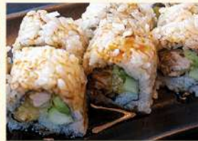
SALMON TEMPURA ROLL 10.00