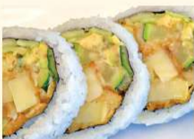
VEGGIE TEMPURA ROLL 9.00

5 pcs cucumber, avocado, crab, yamagobo, kaware, eel sauce