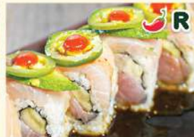
DOUBLE HAMACHI ROLL 15.00

california roll with yellowtail and salmon, sliced lemon, ponzu sauce