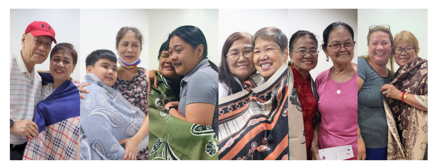
IN PHOTO: Breast cancer warriors share a warm embrace with their loved ones at LHDF's Cover with Love event.

As the season of love unfolded, it was the perfect time to celebrate connections and affection. The Love Hope Dream Foundation (LHDF) hosted the Cover with Love: A Valentine's Special event. This giving program aims to uplift breast cancer warriors and provide emotional support during the challenging times they face. Held at The Bloc Roof Deck, the intimate gathering brought together breast cancer patients and their loved ones – a husband, a son, a daughter, a sister, and a friend, in a celebration of love and resilience.