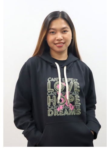
Unisex, S - XL LOVE HOPE DREAM T-SHIRT