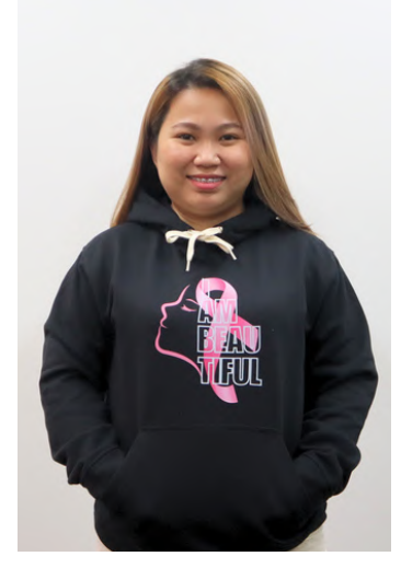
Unisex, S - XL I AM BEAUTIFUL T-SHIRT