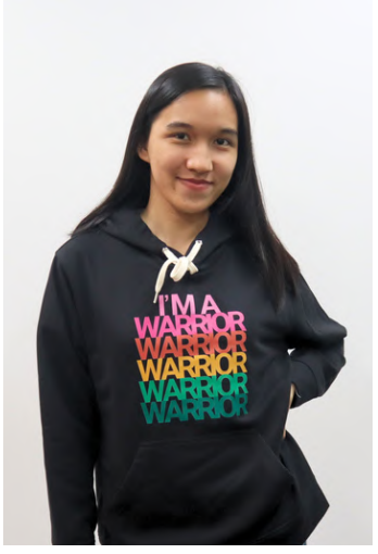
Unisex, S - XL I'M A WARRIOR T-SHIRT