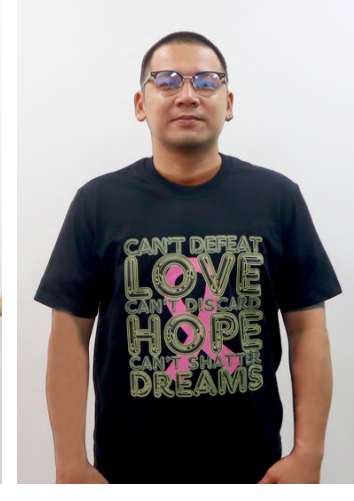
Unisex, S - XL LOVE HOPE DREAM T-SHIRT