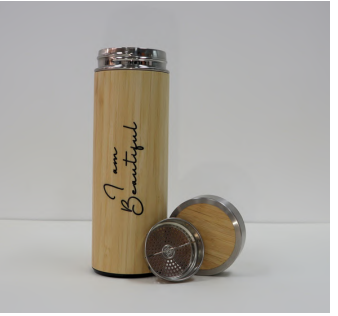
Wood I AM BEAUTIFUL TUMBLER