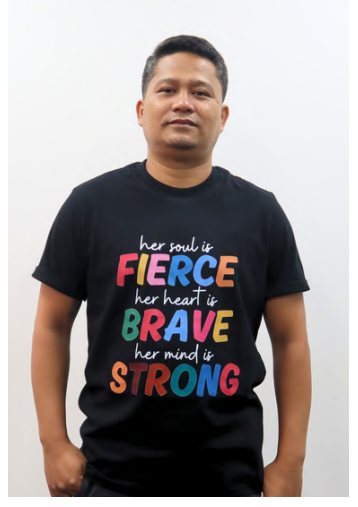
Unisex, S - XL FIERCE BRAVE STRONG T-SHIRT