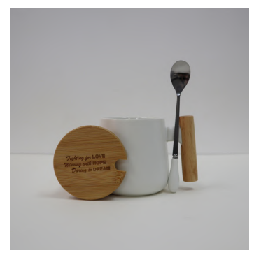
Nordic Ceramic LOVE HOPE DREAM MUG