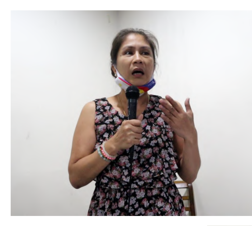
Another cancer warrior expressed, "Thank you so much Love Hope Dream Foundation. Nabigyan kami ng pagkakataon na mag-openup ng aming mga saloobin tungkol sa aming mga karamdaman."

("Thank you so much Love Hope Dream Foundation for giving us the opportunity to open up about our feelings on breast cancer.")