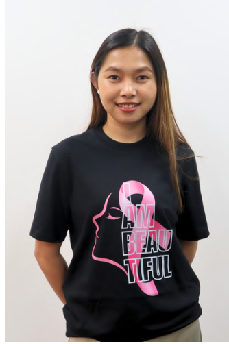
Unisex, S - XL I AM BEAUTIFUL T-SHIRT