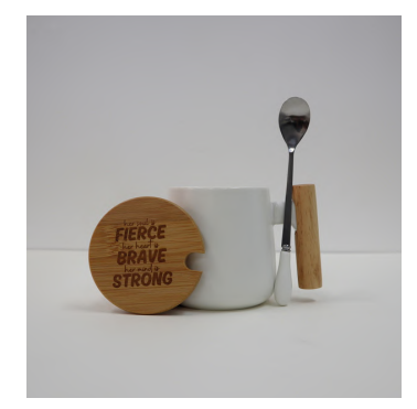
Nordic Ceramic FIERCE BRAVE STRONG MUG

Your perfect mug for every sip of your daily brew.