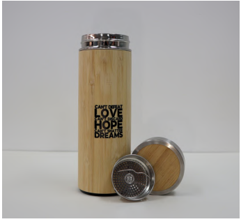
Wood LOVE HOPE DREAM TUMBLER