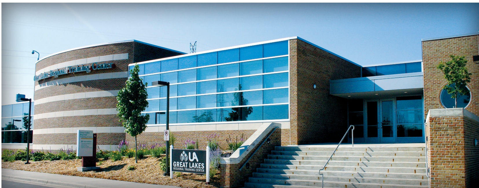
Great Lakes Regional Training Center at Washtenaw Community College