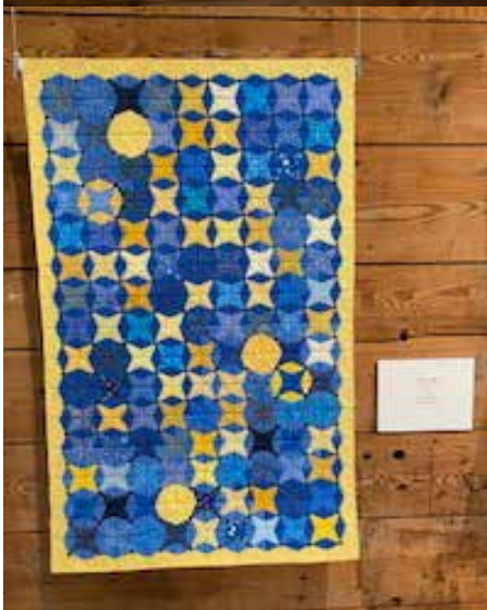
Stars at Night Le Roy, WV 2020 20" x 32" Original Design 13,440 pieces