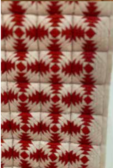
Ten Grand Le Roy, WV 2020 10" x 10" Original Design 10,469 pieces