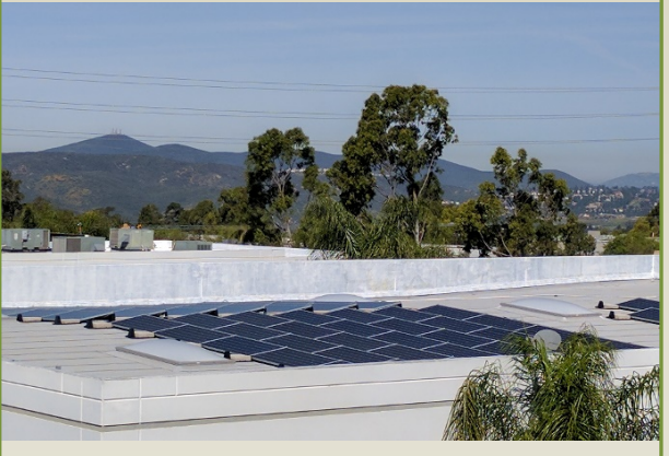
Make your business more energy independent

Making your commercial building a greener place is a commitment to yourself, your employees, your community, and the planet. It is also a learning process. As exciting new technologies, products, and scientific breakthroughs emerge, staying educated on the "how's and why's" of maintaining or upgrading your green property is the best way for you to ensure your efforts are as effective, economical, and beneficial as possible.