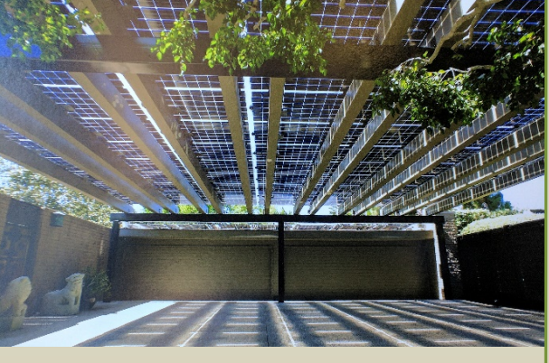
Make your business greener