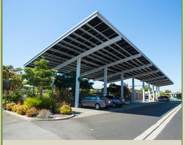
Make your business employee friendly