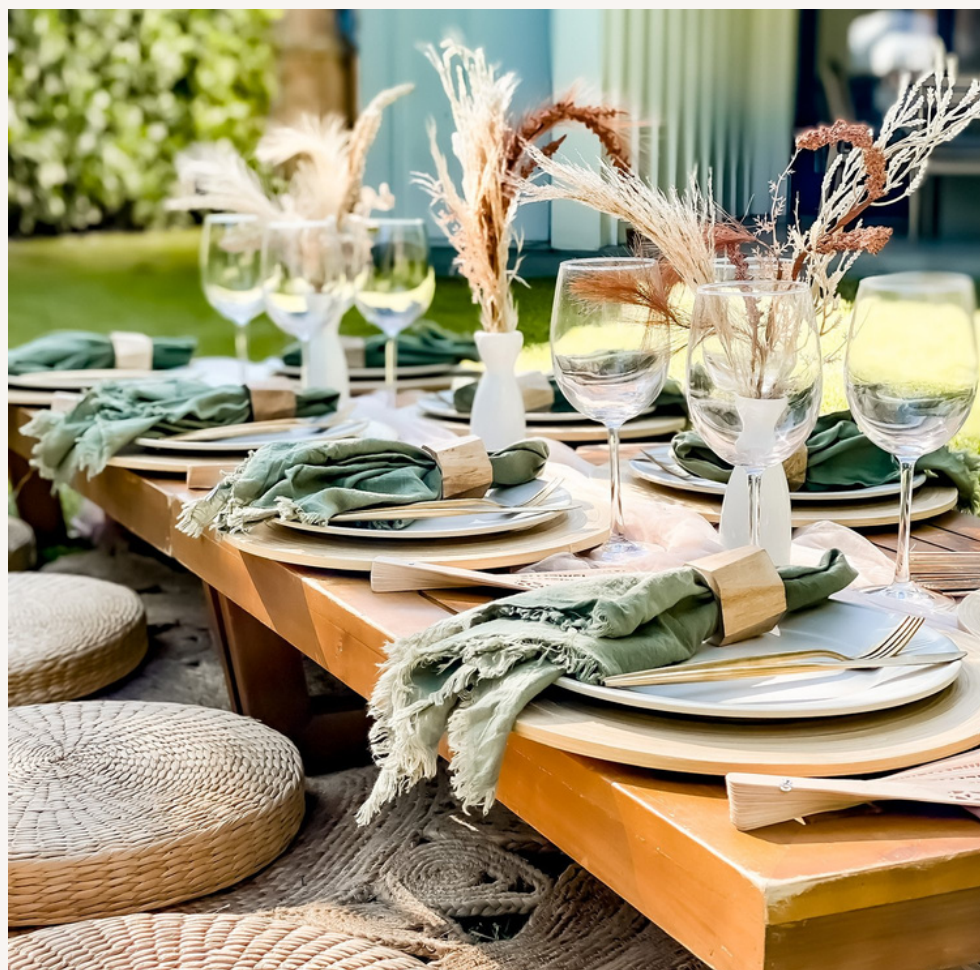
EARTHY & ORGANIC