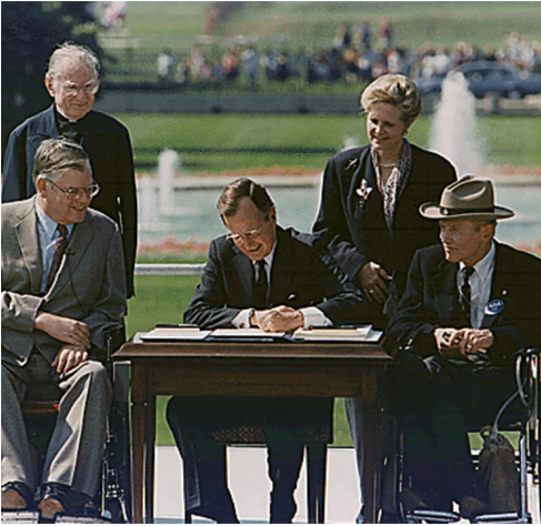
President George H. W. Bush signing the ADA on the South Lawn of the White House while Justin Dart, Jr. (right) and others watch, July 26, 1990.

The Americans with Disabilities Act (ADA), signed into law on July 26, 1990, ensures civil rights for individuals with disabilities and prohibits discrimination in employment, education, transportation, and public accommodations.