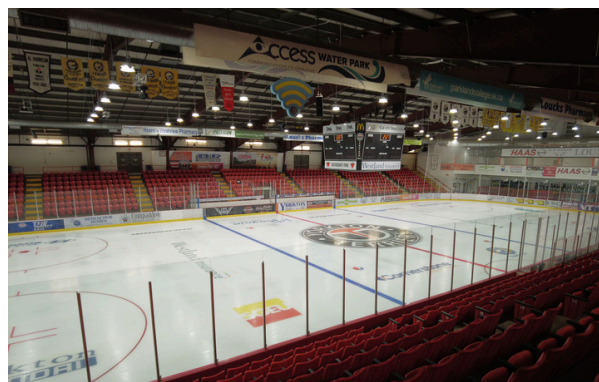
Home of the Yorkton Junior A Terrier hockey team