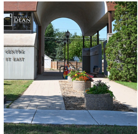
Home of the Yorkton Arts Council, Yorkton Film Festival and Godfrey Dean Art Gallery