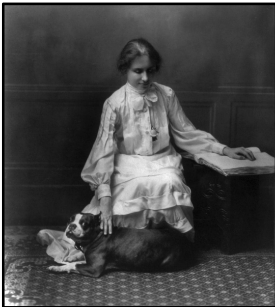
Helen Keller poses here with her Boston Terrier, Sir Thomas Belvedere (nicknamed Phiz), in this photo from March, 1925. Her classmates at Radcliffe University in Massachusetts purchased it for her after the dog became attached to Keller during a class trip to a kennel, and he was her constant companion throughout her college years.